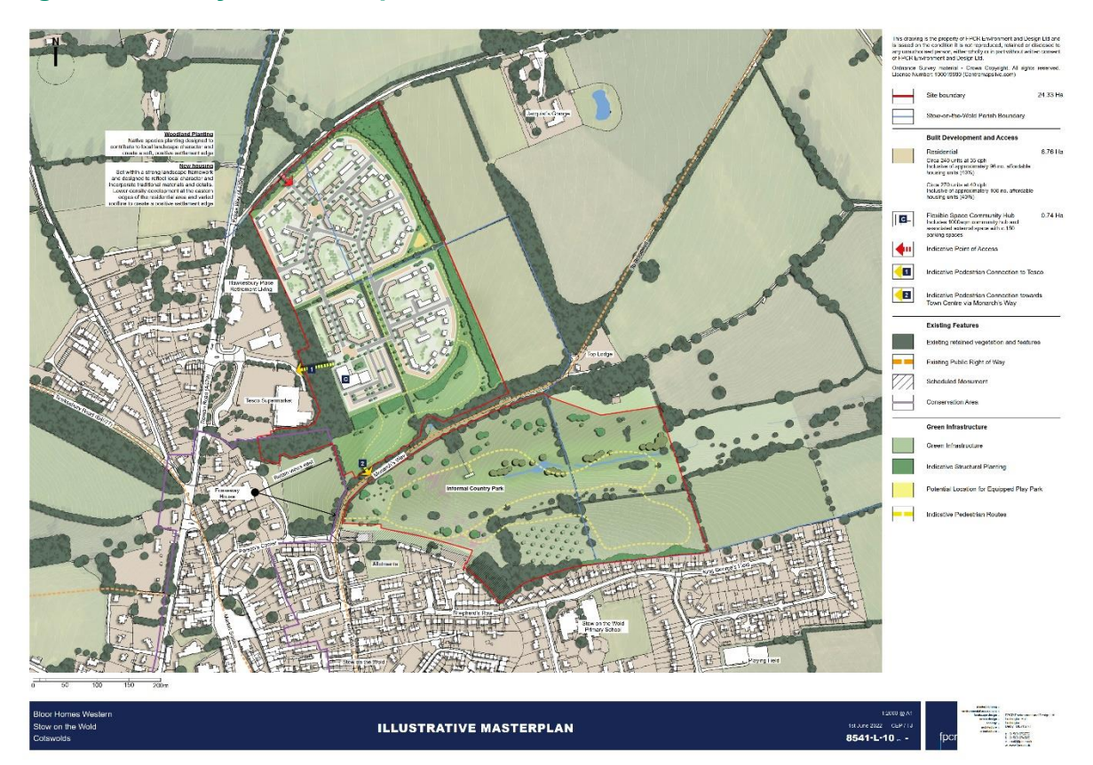
Figure 5.2: Early Indicative plan for Sites 6 and 79