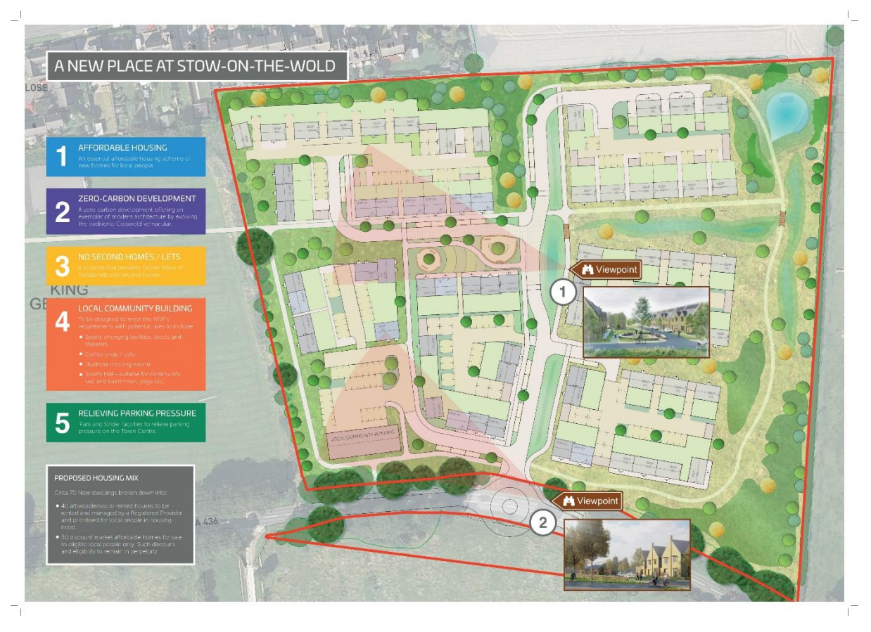
Figure 5.3: Indicative plan for Sites 9 and 10

<sup>9</sup> Plans have since been updated.